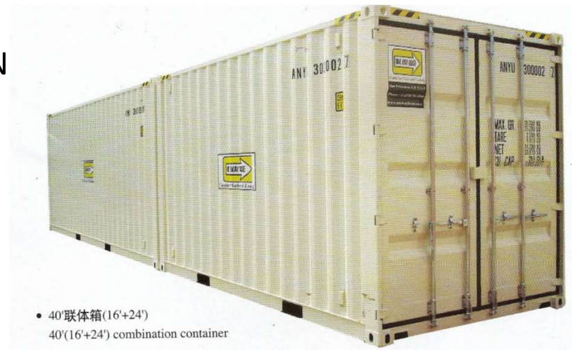
• 40'联体箱(16'+24') 40'(16'+24') combination container

OWL Inc. is also supplier of USED 2 nd HAN and NEW containers to the DOMESTIC leasing Industry.